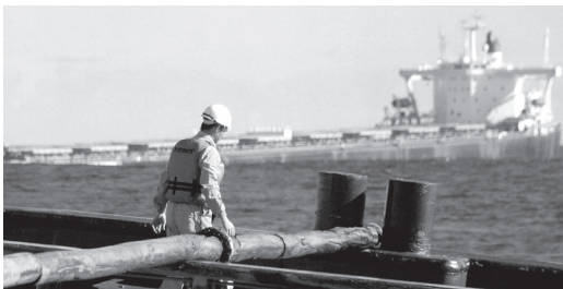
provides effective protection when steel tow ropes start throwing their weight around.